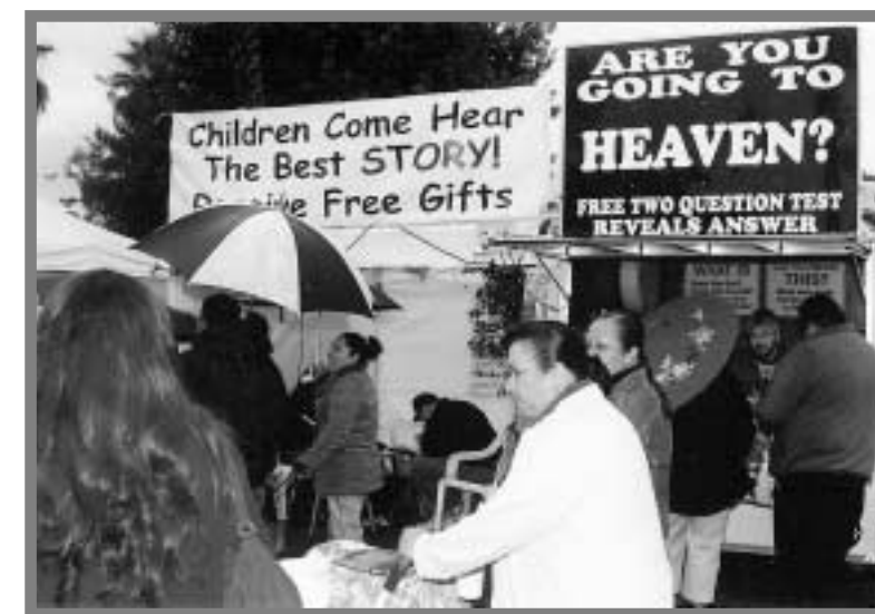
Leading people to Jesus Christ is our goal, RAIN OR SHINE!

Come for the training even if you don't sign up for a fair shift—